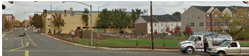
GATEWAY BUILDINGS have been a long time coming. Although the townhouses (right) were completed long ago, for years an empty lot (above) greeted people entering Pottstown from the Hanover Street bridge. Now the lot has been developed with two commercial-residential buildings.

The repurposing of the Mrs. Smith's pie factory is almost done. For decades, Mrs. Smith's was a mainstay of the borough. In 1998 the company was sold and pie-making was relocated to Oklahoma.