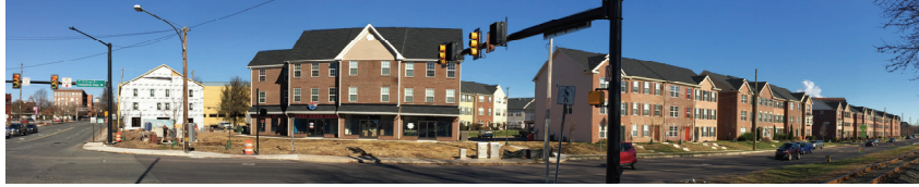
HANOVER SQUARE gateway building stands at the entrance to Pottstown across from the Hanover Street bridge. Second gateway building (white at left) awaits a brick façade. Townhouses (at right) face the Industrial Highway. The project has created an attractive entryway to Pottstown.