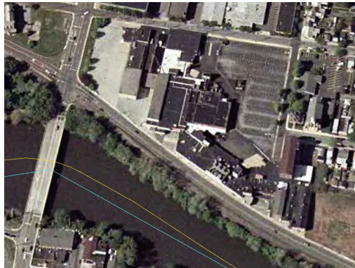
MRS SMITH'S FACTORY COMPLEX is seen in an aerial photograph in 2002.

All told, the process has taken 20 years.